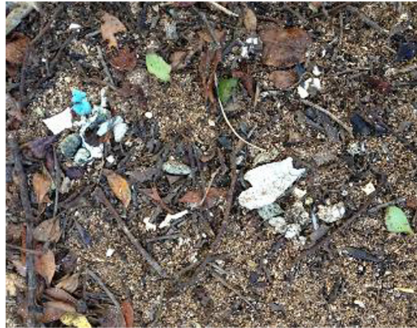
Fig. 4. Example of a sprayed regurgitation from a flesh-footed shearwater ( Ardenna carneipes ) from Lord Howe Island. These pellets are not intact, and thus of limited use to assess small microplastics that are easily lost to the environment.