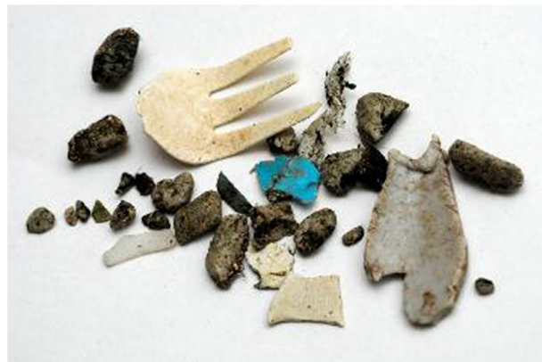
Fig. 5. Plastic items and pumice found in a pellet from a flesh-footed shearwater ( Ardenna carneipes ) from Lord Howe Island.

being lost to the environment or inflated because of additional plastic pieces from the environment. The GIT may be preserved (e.g., freezing or submersion in ethanol) so that it can be processed under controlled laboratory conditions at a later date.