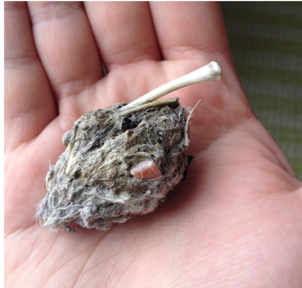
Fig. 3. A regurgitated pellet collected from a great skua ( Stercorarius skua ).

interest (Ryan and Fraser 1988; Votier et al. 2001; Hammer et al. 2016). In contrast to the accumulated plastics found during stomach dissections, pellets, like regurgitations, represent a snapshot of only a short period of time. Most pellet collections are also limited to the breeding season when marine birds are at terrestrial nesting sites, limiting seasonal comparisons in many species.