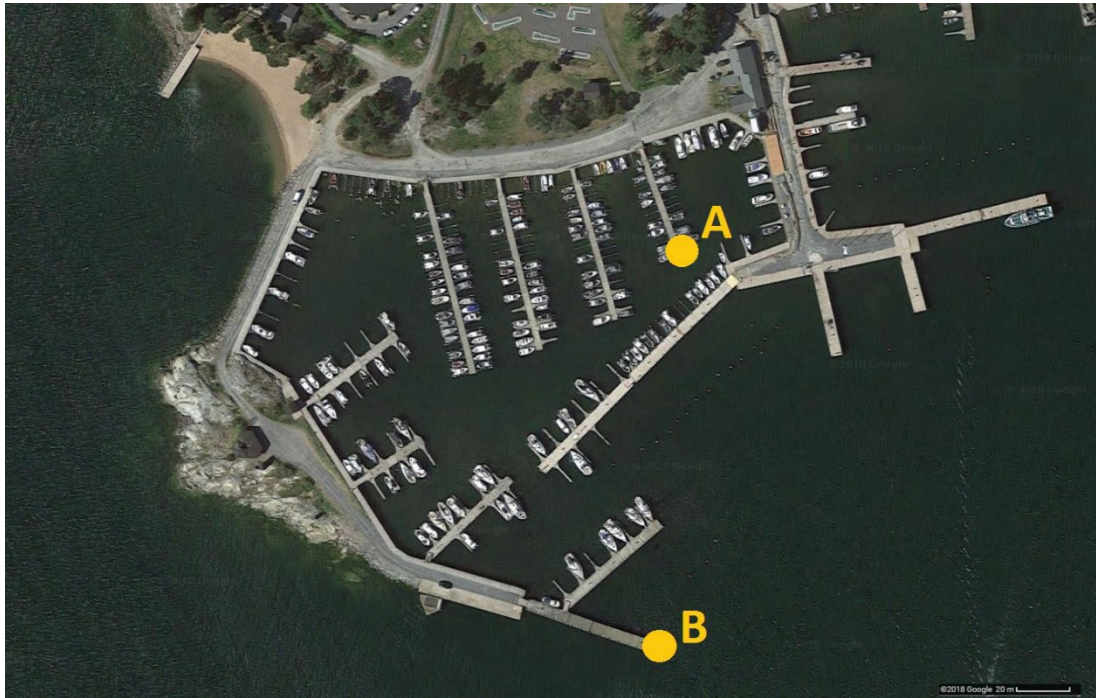
Figure 1. A marina divided into an inner (A) and outer subarea (B).

The monitored marinas should be divided into two subareas; Inner and outer marina (Figure 1.) A minimum of one set of fouling plates and two scraping samples per subarea should be taken. Sampling should be conducted during summer when the seasonal succession of fouling organisms is at its highest. The optimum time window for sampling fluctuates annually and across different parts of the Baltic Sea. The fouling plates should be deployed during May or June and retrieved during August or September. The scraping samples should be taken only during the second sampling visit. A chronological order of the sampling sites should be maintained for comparable results. Sampling sites should be easily reachable and accessible from the piers. Entering the piers may require a permission from local authorities.