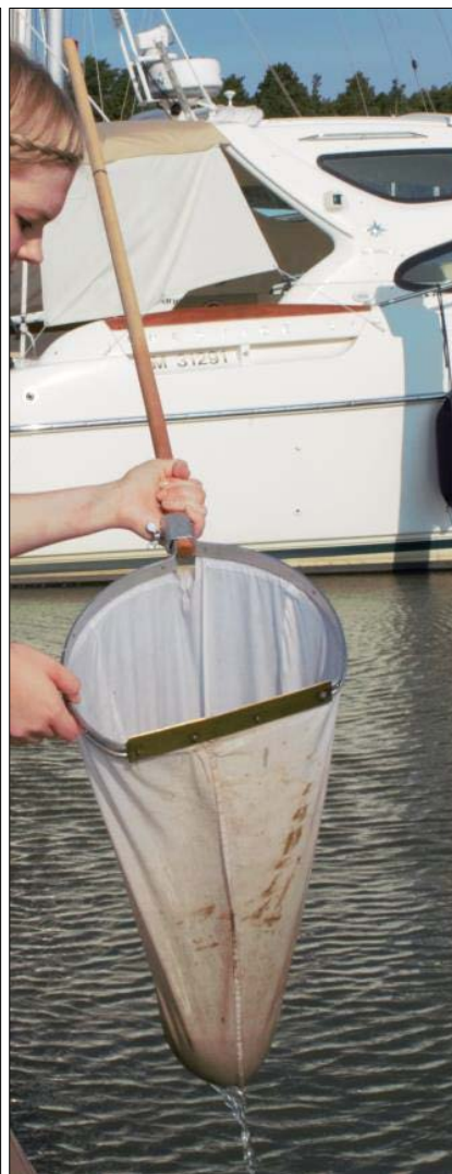
Figure 3. A hand-held scraping tool.

Illustration and photo by Keep the Archipelago Tidy Association.