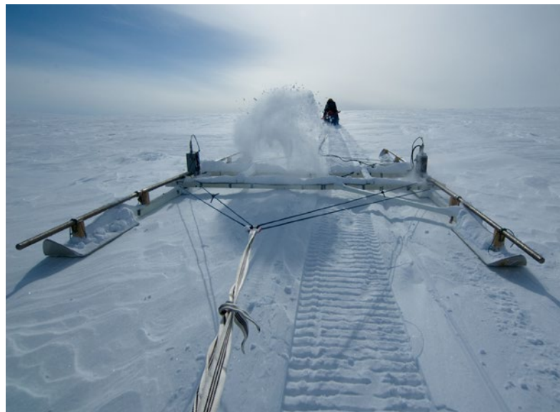
Greenland Zackenberg.

After the International Polar Year 2007/08, Austrian polar research received funding from the Federal Ministry of Science and Research for the strategic development of polar research, which enabled both the Austrian Polar Research Institute APRI and membership in the International Arctic Science Committee to be established.