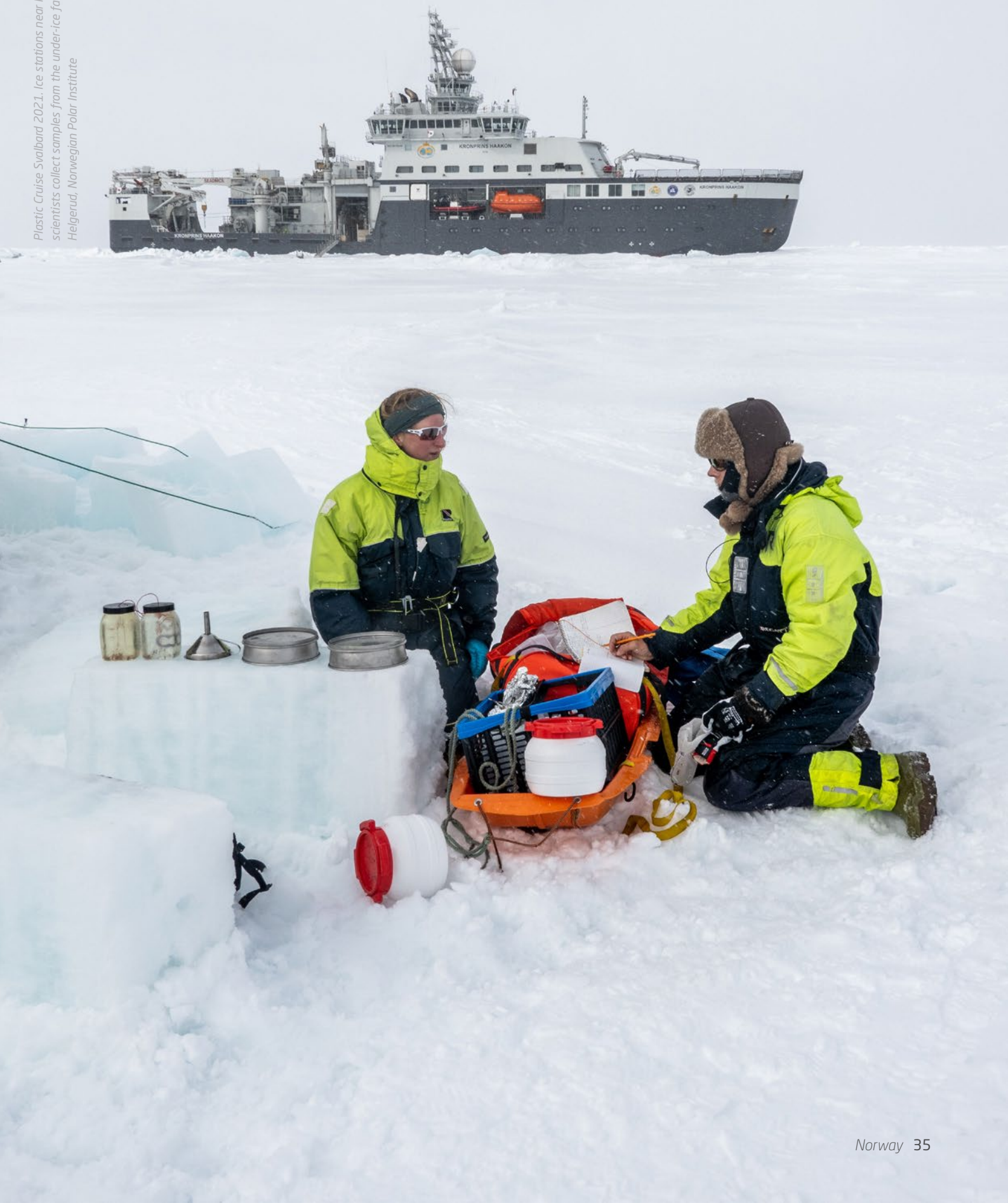
Plastic Cruise Svalbard 2021. Ice stations near Nordaustlandet, where scientists collect samples from the under-ice fauna.