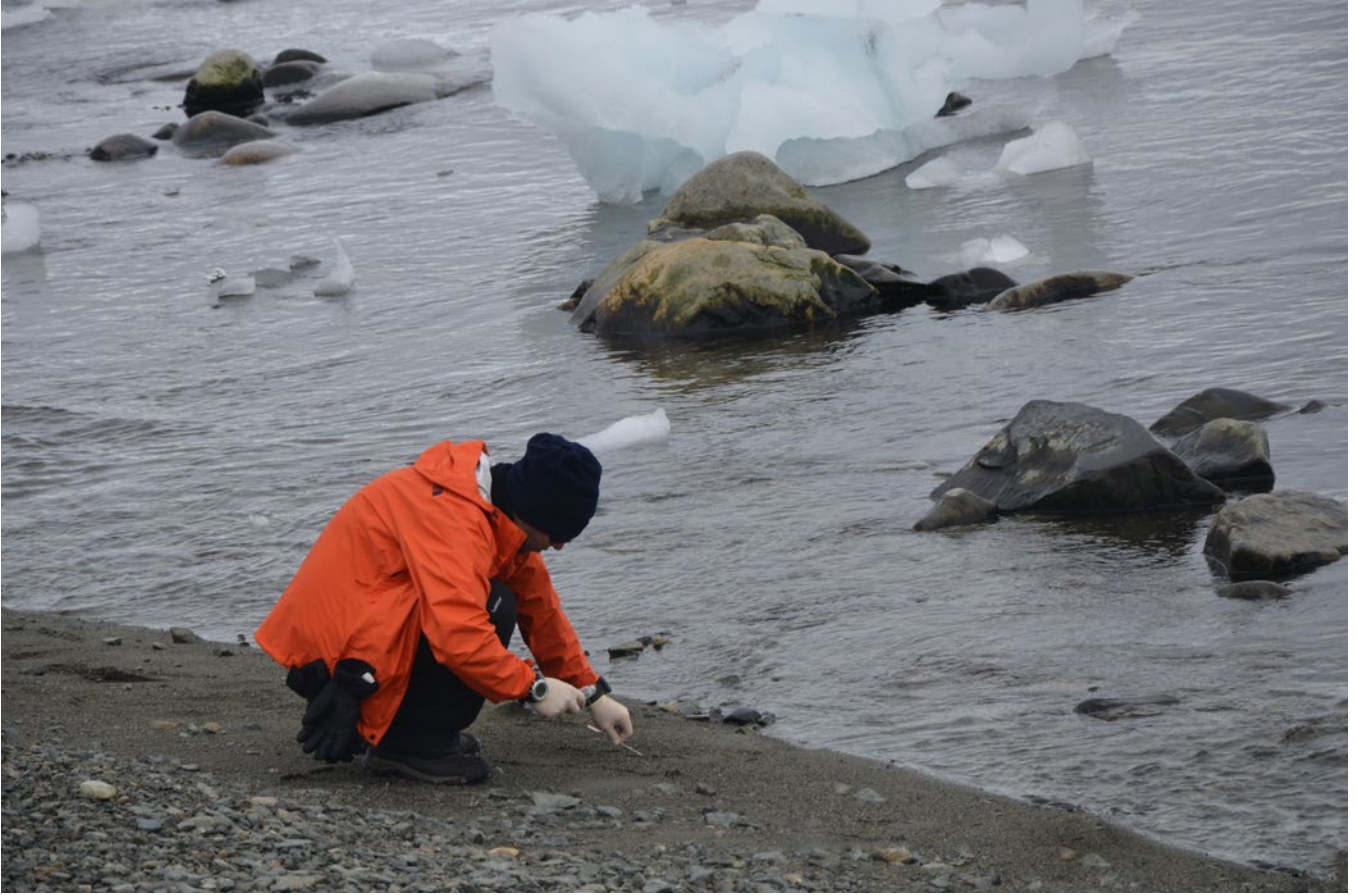
2016-2017 Antarctic Season, Antarctic Peninsula.