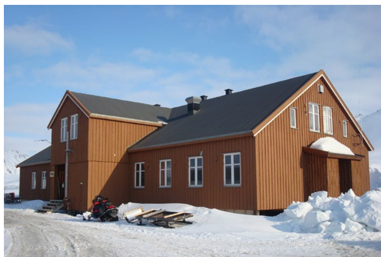
The Italian station from outside.

In Antarctica, international collaboration is promoted by providing access to and hospitality at the Italian stations and by supporting projects that aim to be carried out in non-Italian stations. Italy's main cooperation partners in Antarctic research are France, South-Korea, USA, Chile and Argentina. In the Arctic Italian scientists mainly cooperate with researchers from Norway, Germany, South-Korea, Denmark and Japan.