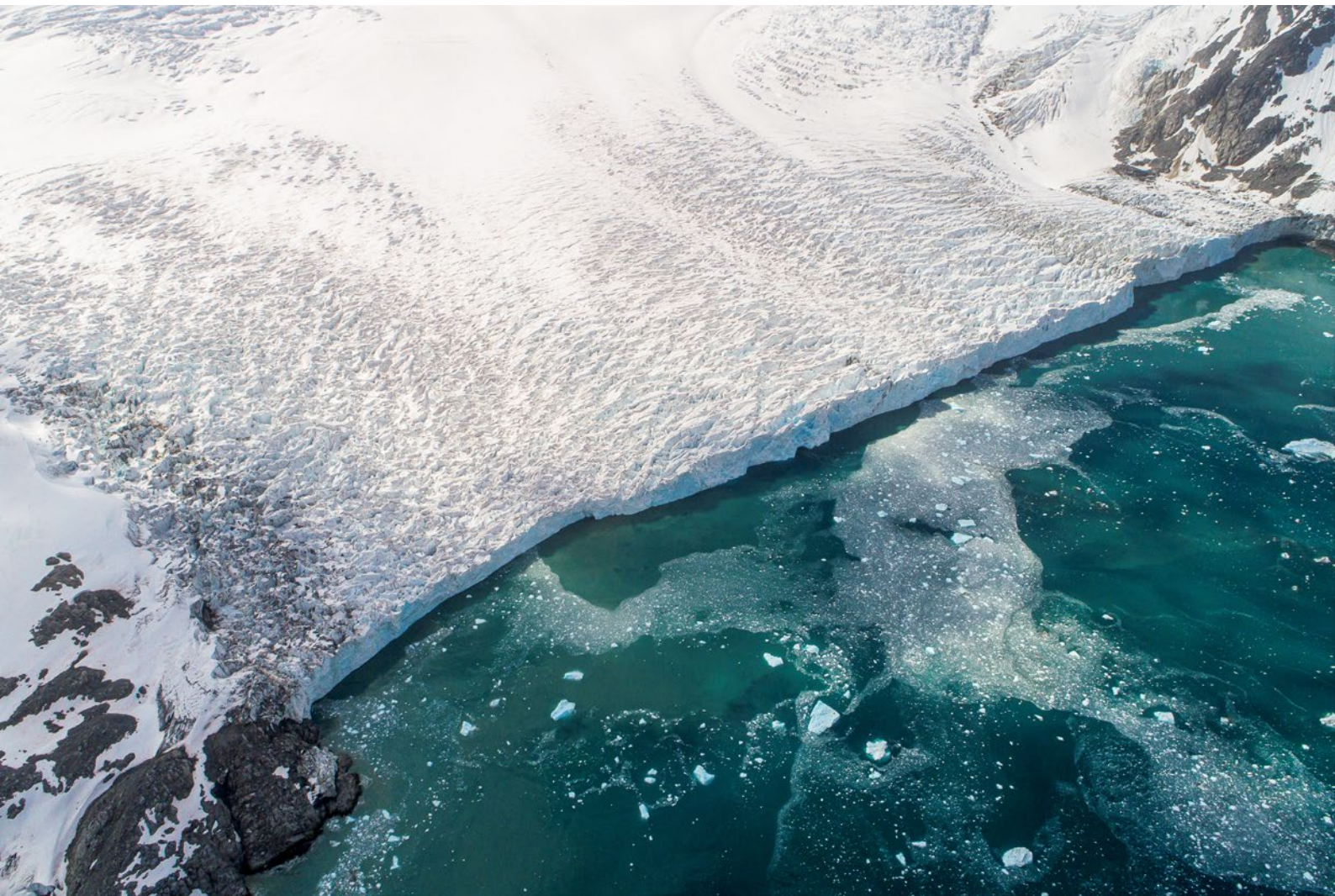
Hunter's glacier, Livingston Island.