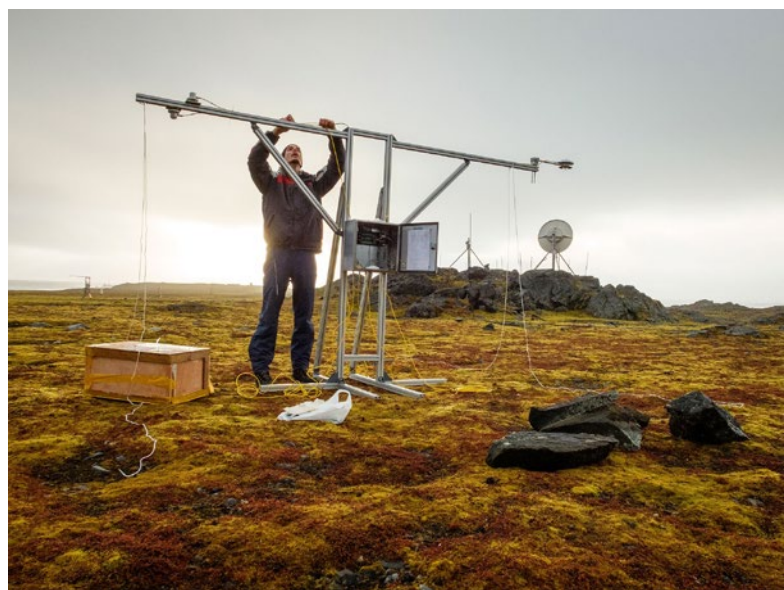
Installation of solar photometer by Estonian scientist at Polish station Hornsund on Svalbard.

In the EU projects DAMOCLES and within the international MO-SAiC expedition, Estonia cooperated with the AWI (Germany), the Finnish Meteorological Institute (Finland), Bern University (Switzerland), Heidelberg University (Germany), Hefei University of Technology (China) and with Argonne National Lab (USA).