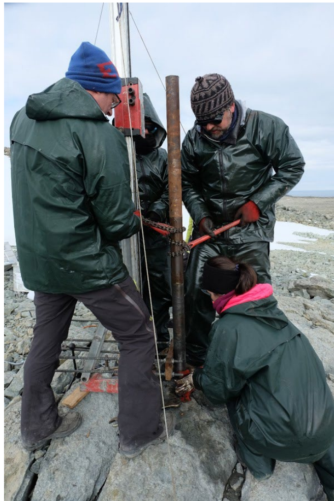
Antarctic Activities Portugal.

Portugal contributes to the international logistics in Antarctica with an annual freighted flight operating from Chile but has no stations in the polar regions. Hence, international cooperation is essential for national field activities, especially in Antarctica. Since the start of the Portuguese Polar Programme, Spain has been the main cooperation partner, supporting the transport of personnel and equipment, as well as the accommodation of scientists in the Spanish Antarctic stations. This collaboration is framed by a bilateral scientific agreement signed in 2009.