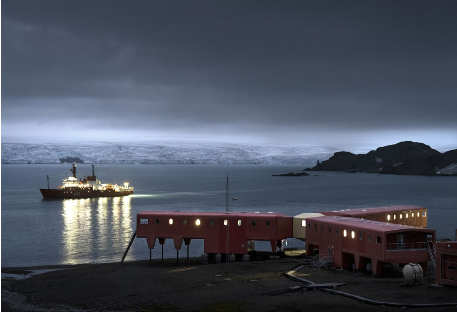
RV Hesperides and Juan Carlos I station.