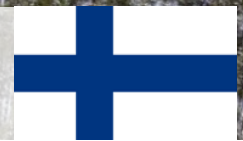
Oulanka Research Station.