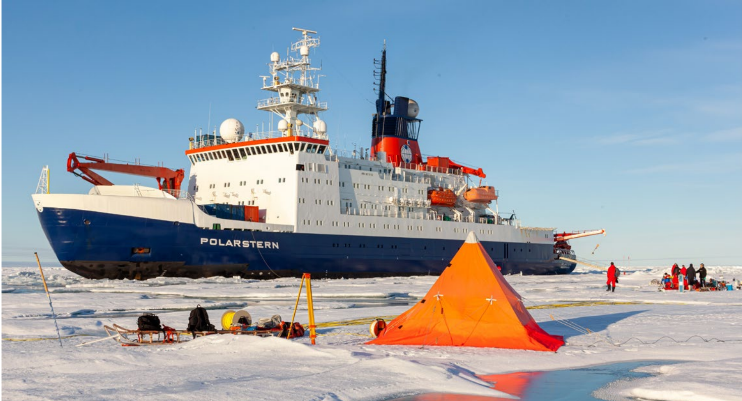
Ice station work during the RV Polarstern expedition "TransArc" in the central Arctic Ocean in summer 2011.