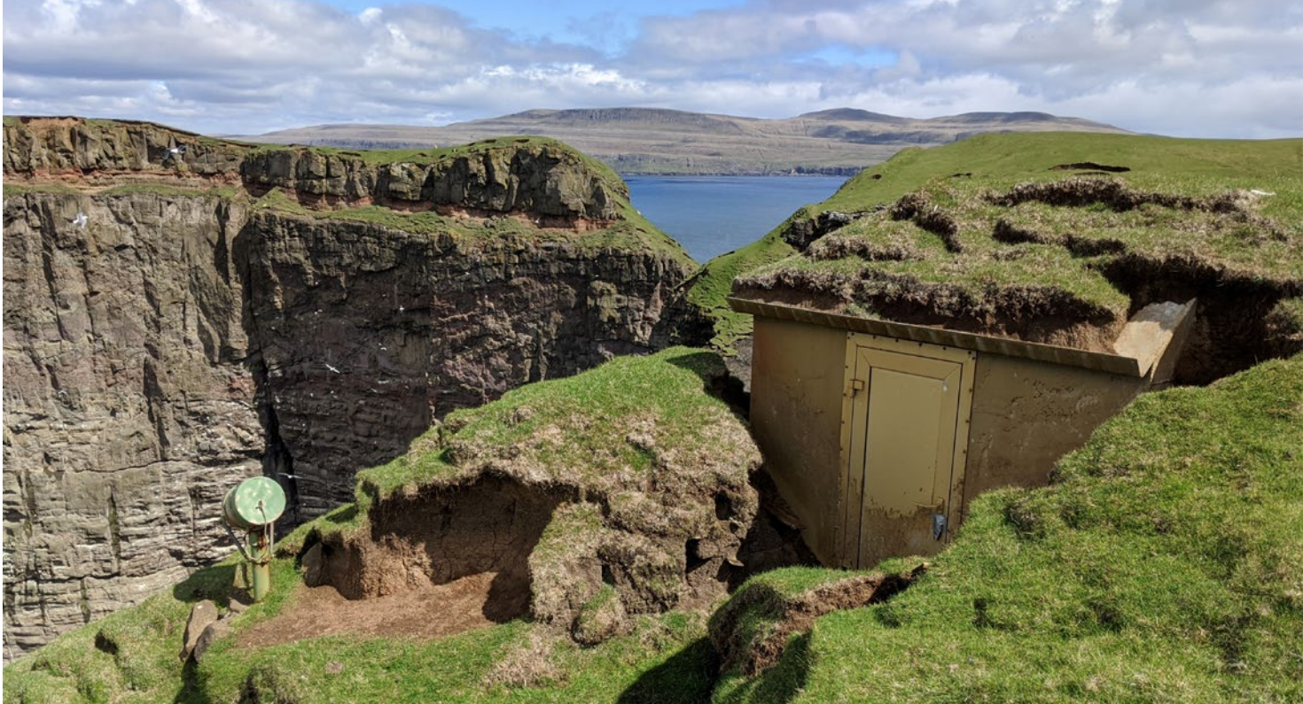
Two Islands called Skúvoy and Nólsoy.

The latest national research strategy and action plan under the headline “Knowledge & Growth” covered the period 2011-2015.