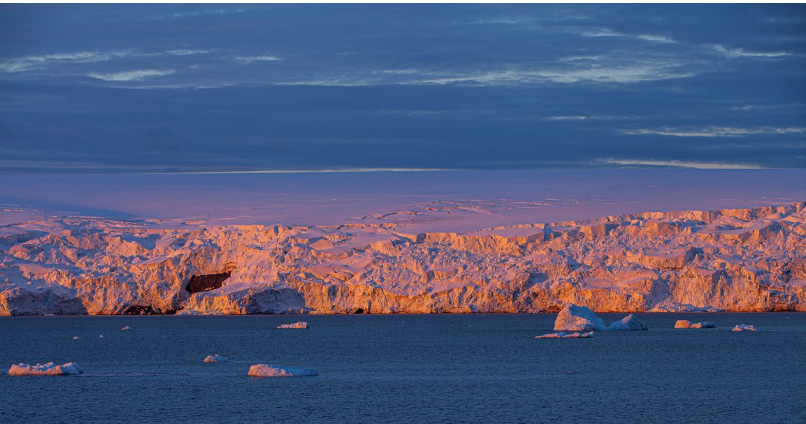
Sunset view of Smith Island.