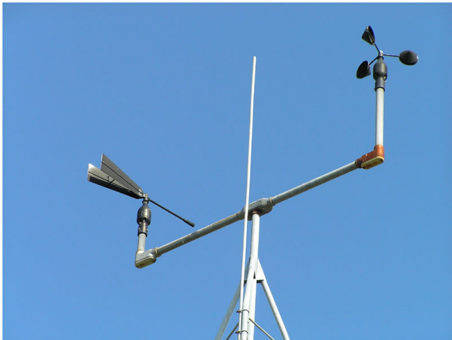
Figure 2-3. Close-up of a cup anemometer.