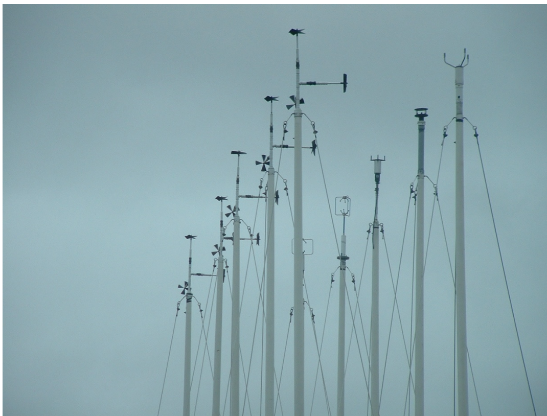
Figure 2-4. Acoustic anemometers at the Otis Weather Test facility in Cape Cod, Massachusetts. The five masts on the left provide reference wind observations. The five sensors on the right are: 1) RM Young 3-axis ultrasonic anemometer (partially obscured), 2) Gill R3 3-D anemometer, 3) RM Young 2-axis ultrasonic anemometer, 4) Gill Windsonic 2-axis ultrasonic anemometer, and 5) Vaisala WS425 ultrasonic anemometer.

Another popular technology uses ultrasound, either by observing changes in the time of flight of acoustic pulses between several emitter/receiver pairs, or more recently by detecting phase changes in a resonant acoustic wave. Figure 2-4 shows a variety of acoustic anemometers being tested at the Otis Weather Test facility in Cape Cod, Massachusetts. These electronic sensors usually include the circuitry needed to directly output calibrated wind speed, direction, and gust. In some cases, they can also generate an analog output that mimics an impellor/wind vane, easing the replacement of these devices with a sonic anemometer. They excel at observing the lowest wind speeds, but in some cases, the physical structure that supports the emitter/receivers also obstructs wind flow. The problem is most pronounced at extremely high wind speeds. Some sensors are also prone to failure because of roosting birds. Early acoustic anemometers accumulated water droplets on the emitter or receiver resulting in erroneous measurements, which are now readily detected and discarded by the sensor itself before outputting an observation.