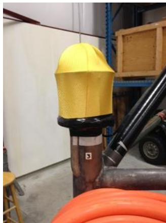
Figure A.3-1. Shrouded hydrophone