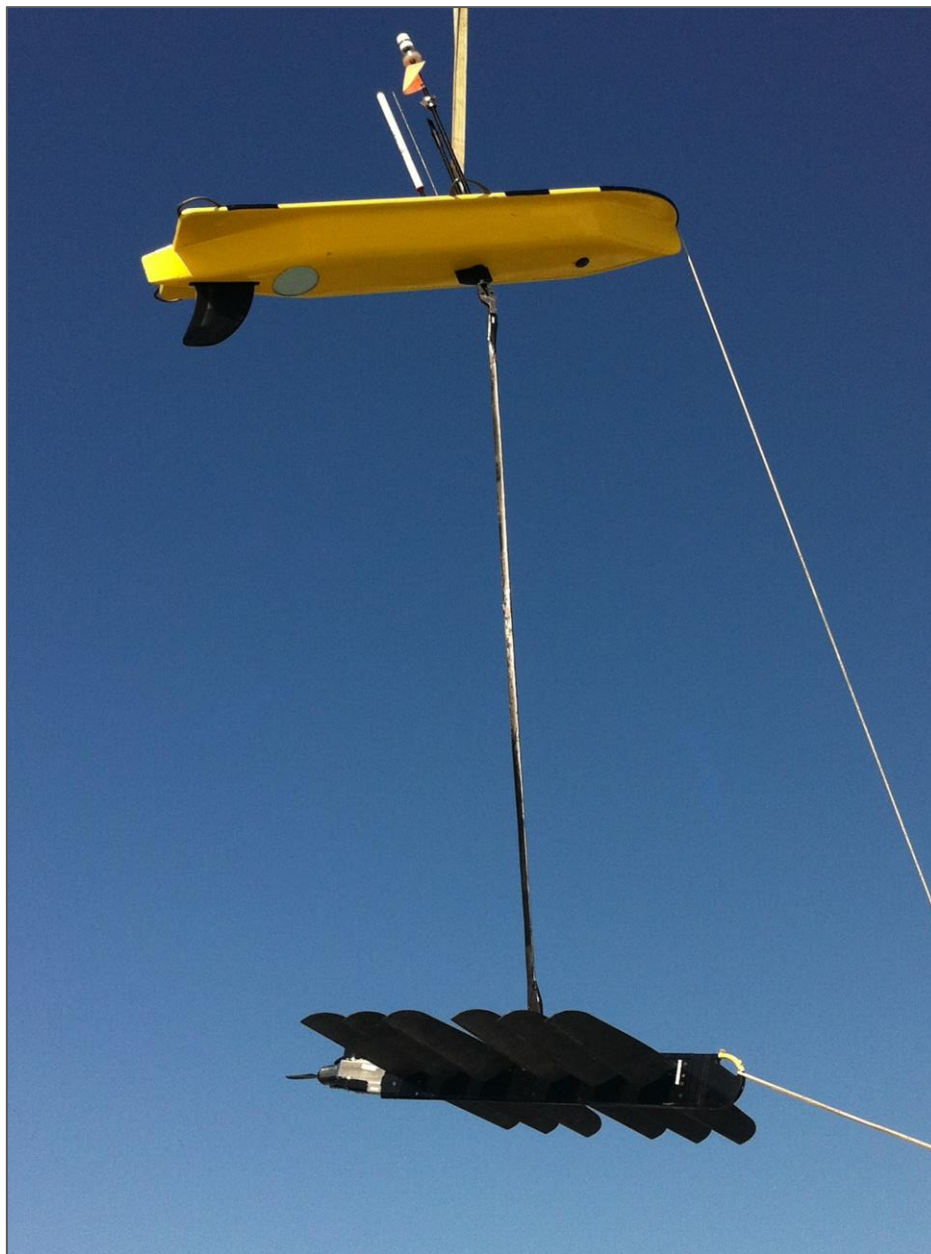
Figure 2-4. Liquid Robotics wave gliders were originally developed for passive acoustic monitoring of marine mammals.

Passive acoustics recorders can also be deployed on mobile platforms such as gliders, profiling floats, or autonomous surface vehicles. Indeed, the Liquid Robotics Wave Glider® was funded and developed to host passive acoustics systems for whale detection. Improvements to power and data telemetry bandwidth limitations are continually emerging for such deployments.