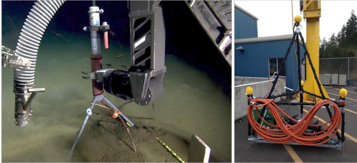
Figure 2-2. Single hydrophone tripod (L) and tetrahedral hydrophone array (R).