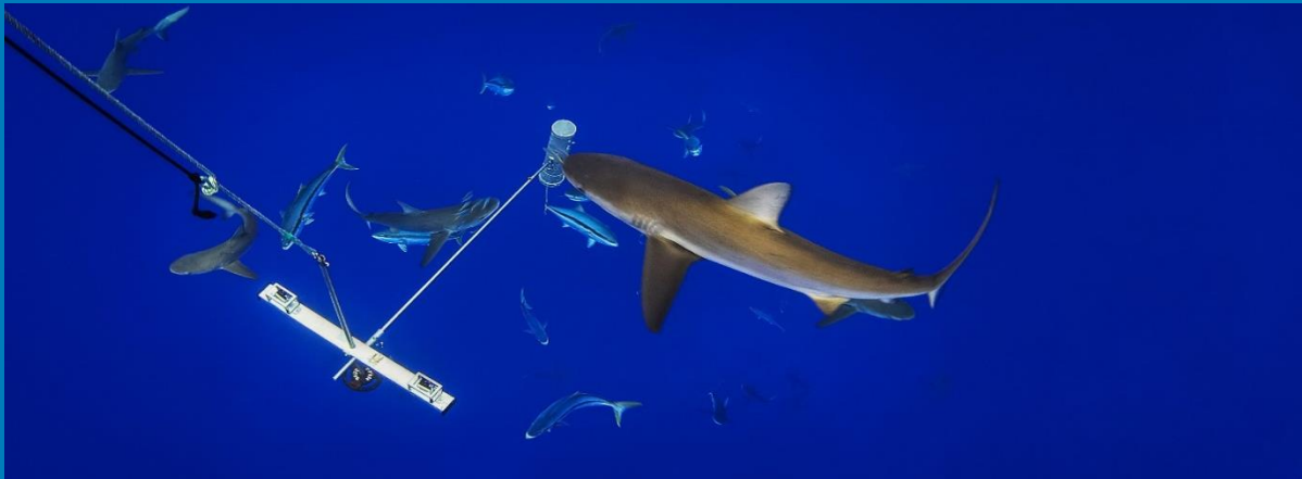
Photograph: Pelagic stereo-BRUV deployed in French Polynesia.