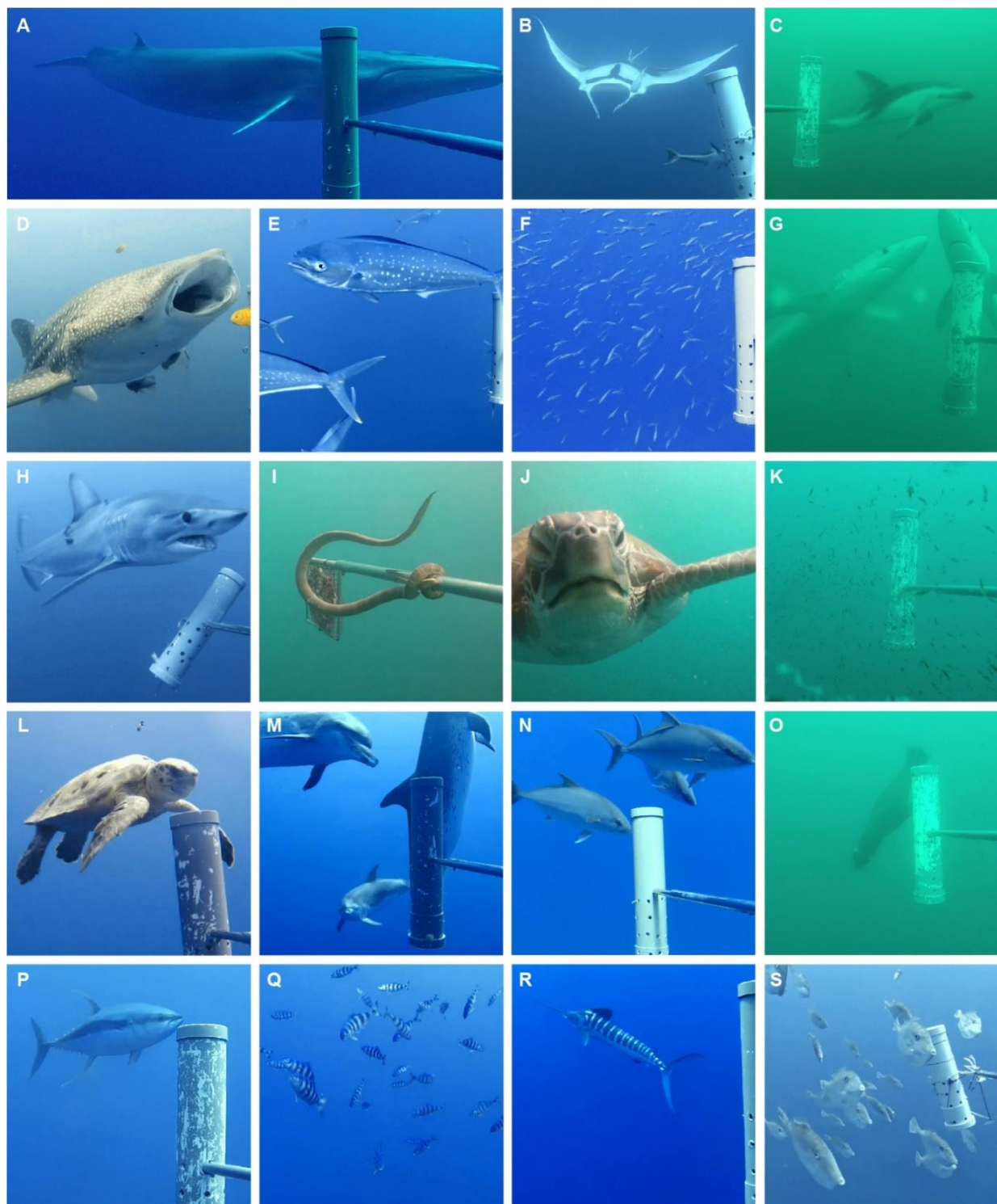
Figure 6.2 Example species observed on pelagic BRUVs. (A) Bryde's whale Balaenoptera brydei , (B) Manta ray Manta birostris , (C) Dusky dolphin Lagenorhynchus obscurus , (D) Whale shark Rhincodon typus , (E) Dolphin fish Coryphaena hippurus , (F) Atlantic horse mackerel Trachurus trachurus , (G) Blue shark Prionace glauca , (H) Shortfin mako shark Isurus oxyrinchus , (I) Sea snake Hydrophiidae sp., (J) Green turtle Chelonia mydas , (K) Krill Euphausia sp., (L) Loggerhead turtle Caretta caretta , (M) Atlantic spotted dolphin Stenella frontalis , (N) Longfin yellowtail Seriola rivoliana , (O) Sub-Antarctic fur seal Arctocephalus tropicalis , (P) Yellowfin tuna Thunnus albacares , (Q) Pilot fish Naucrates ductor , (R) Blue marlin Makaira nigricans , and (S) Unicorn leatherjacket Aluterus monoceros .